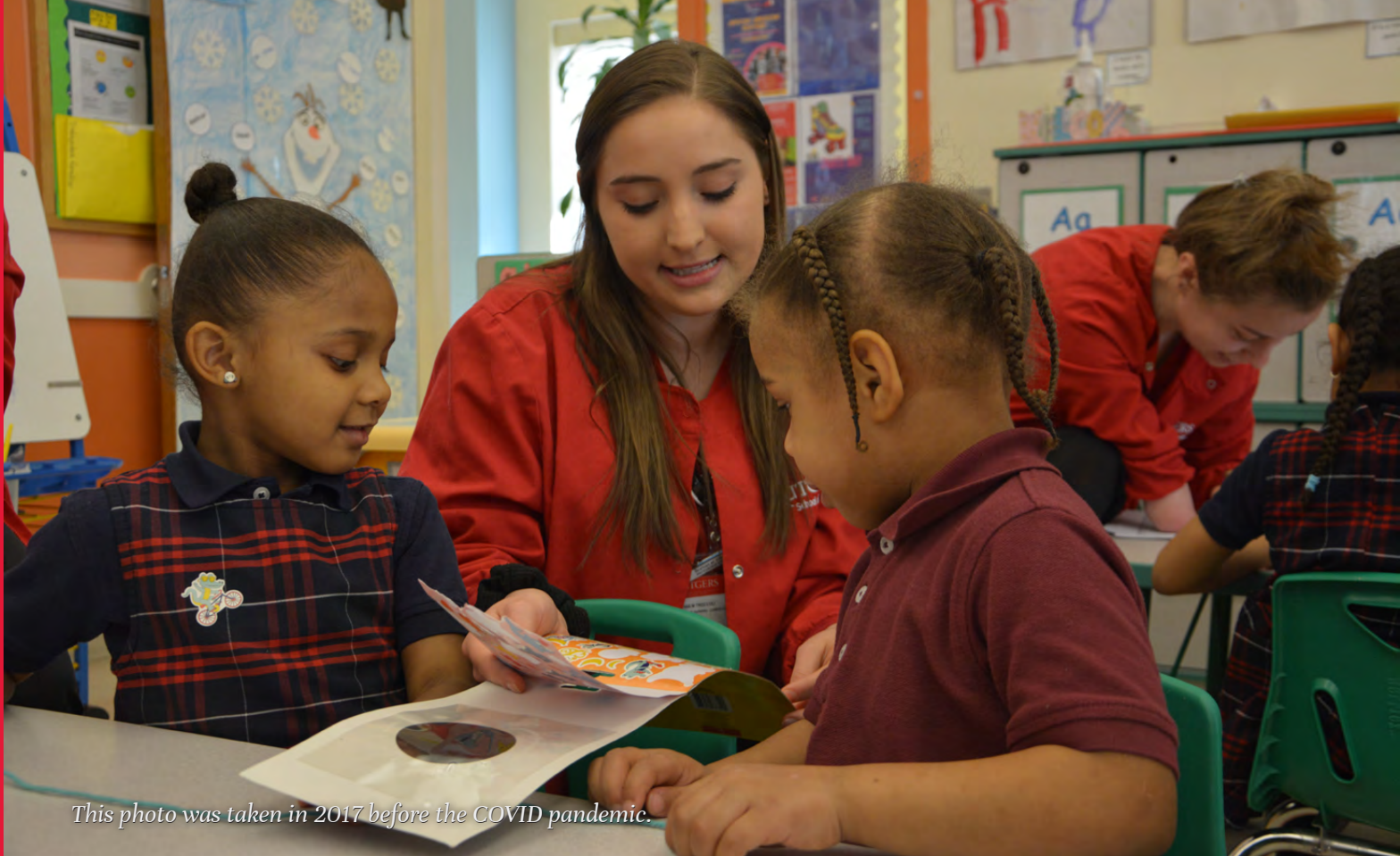
This photo was taken in 2017 before the COVID pandemic.